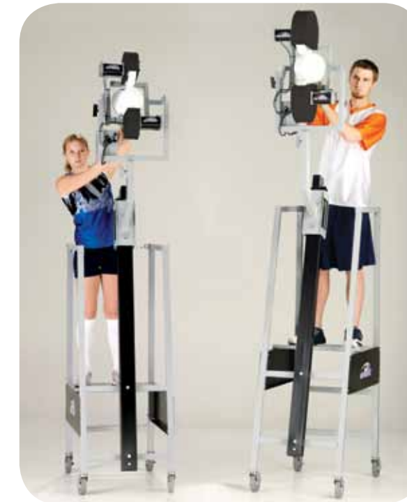
Patented design of the Attack and Attack II provides full range of spins, effortless, counter-balanced raising and lowering of throwing head & a portable operator stand. With the Attack and Attack II Volleyball Machines any team can practice against a realistic jump serve, the edge that can build championship teams!