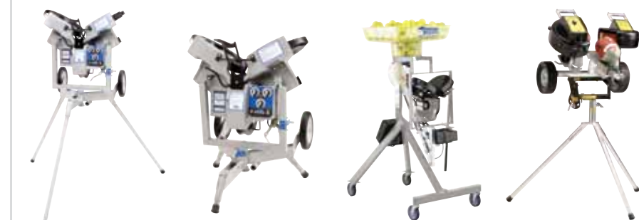
Baseball Hack Attack Softball Hack Attack Ace Attack (tennis) Snap Attack (football)

Sports Attack also makes quality professional baseball, softball, tennis & football training equipment.