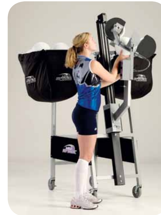
The Attack II (shown above with two ball bags sold separately) and the Attack will both deliver the new weighted setting ball used by many international teams.